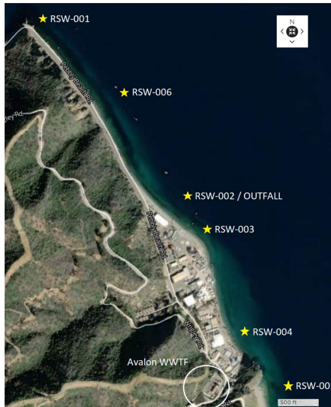
Figure E-2. Locations of Receiving Water Monitoring Stations